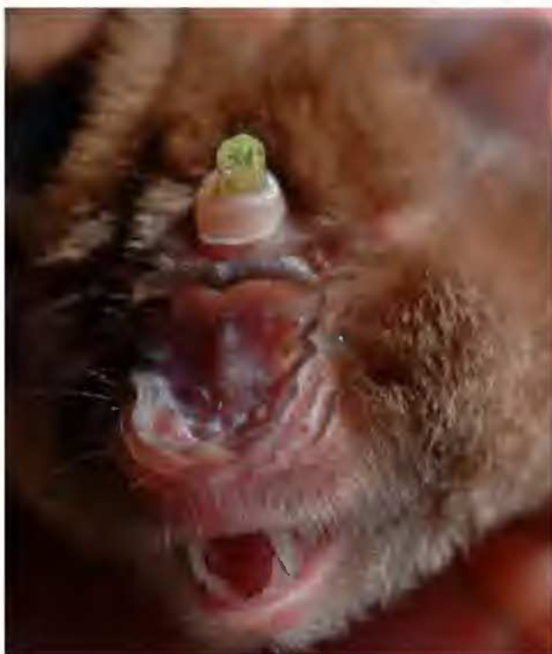
Figure 4. Hipposideros galeritus (TTU 108375) from Mount Penrisen with a facial gland behind the noseleaf (see Tate 1941; Hill 1963; Nowak 1999). In an undisturbed state this gland is nondescript; however, when the lateral sides of the gland are palpated, the inner part of the gland is visible as in this figure.

Remarks. — Larvatus species group (Corbet and Hill 1992). Hipposideros larvatus was caught in harp traps placed across trails and rock crevices. This is the only species collected in our study that has three lateral leaflets (Payne et al. 1985). Taxonomic reviews from morphological and genetic datasets indicate that more than one genetic phylogroup occurs within this species (Kitchener and Maryanto 1993; Thabah et al. 2006). A genetic distance of 3.5% in the cyt-b gene was observed between a specimen from China (DQ888672) and our specimen from Borneo.